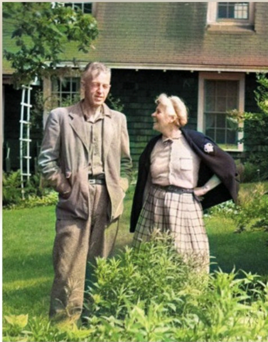
Bill and Lois Wilson