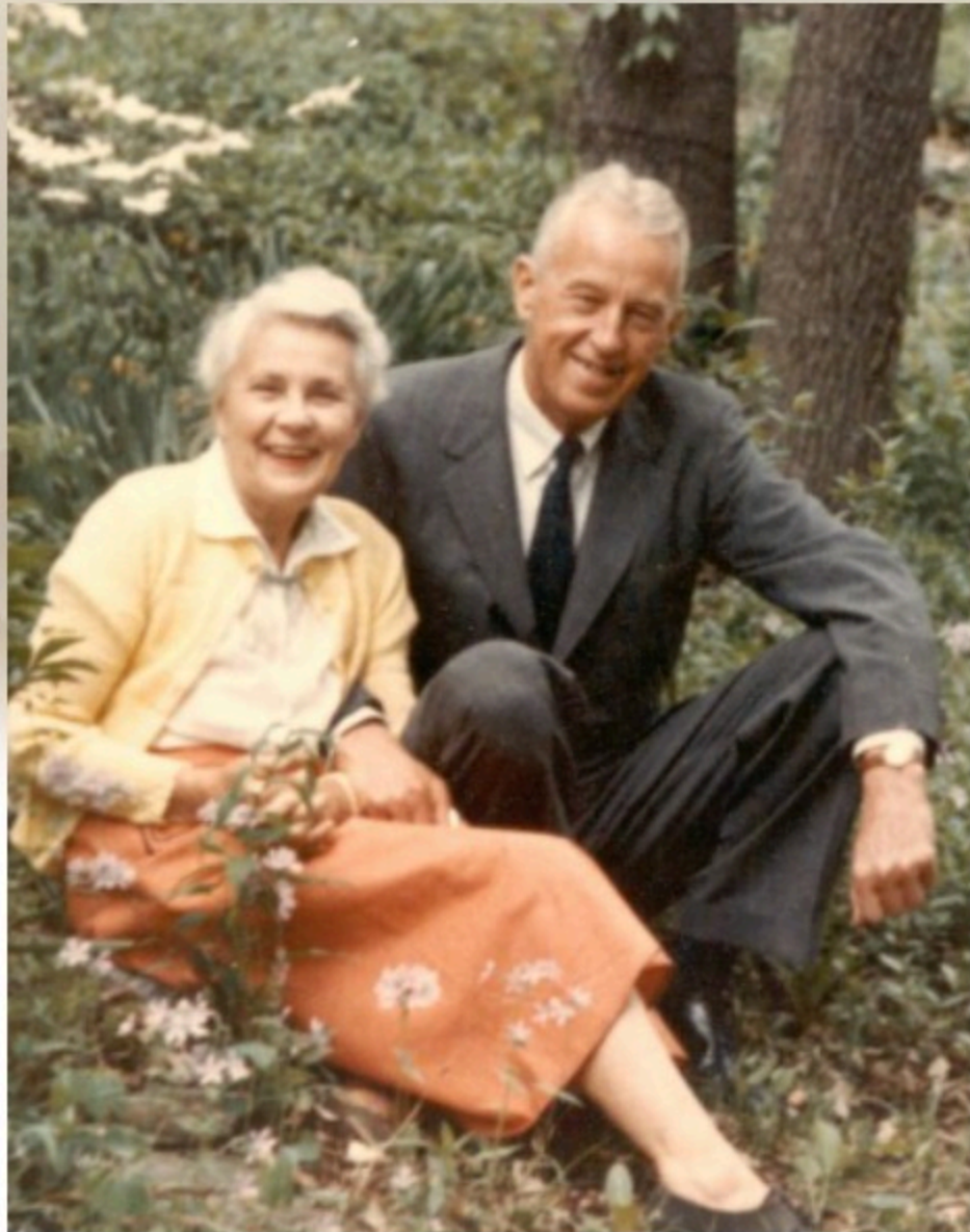
Bill and Lois Wilson at Stepping Stones