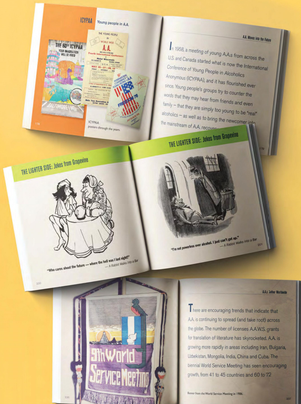
Interior spreads from A Visual History of Alcoholics Anonymous . Copyright © by Alcoholics Anonymous World Services, Inc. All rights reserved. Used by permission only.

Updates in reference to the next South Florida Area 15 Assembly will be provided as the information is received (ie. zoom changes/meeting in person, etc). At this time, it is an in person Assembly.