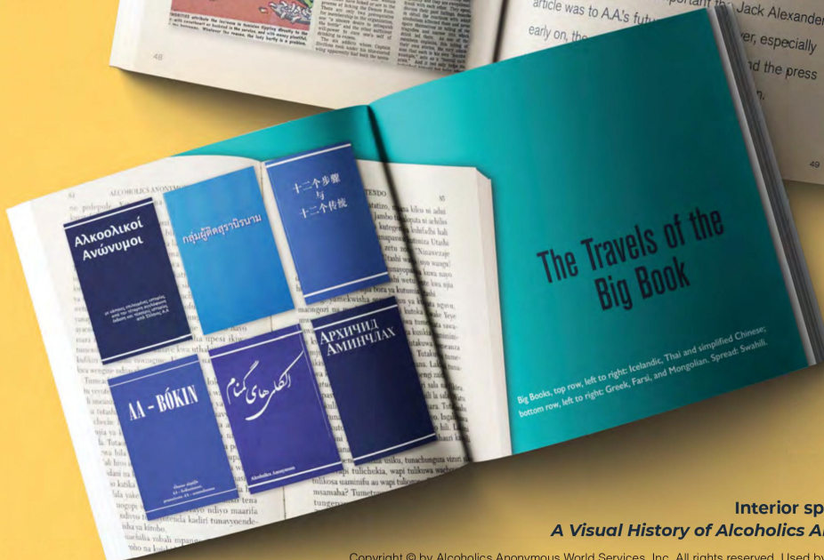
Interior spreads from A Visual History of Alcoholics Anonymous.